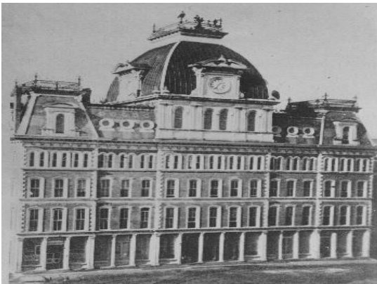
The original Kansas City Courthouse

The first Kansas City Courthouse was located at the corner of 2nd and Main Streets, in a building that was originally intended as a hotel. In 1931, $4 million was appropriated for the present Kansas City Courthouse at 12th and Oak. It was completed in 1934 and dedicated by County Judge Harry S Truman.